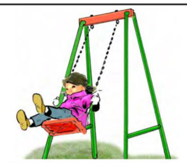
My sister went on the swing.