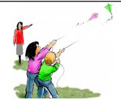
We flew kites.