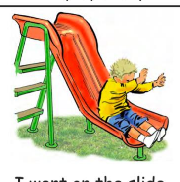
I went on the slide.