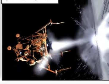
The Lunar Bug lands on the Moon