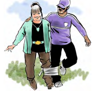
The last race was for mums and dads.