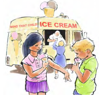
We had ice-creams at play time.